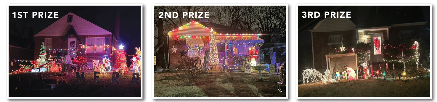
Christmas Lights/Decorations Contest Winners