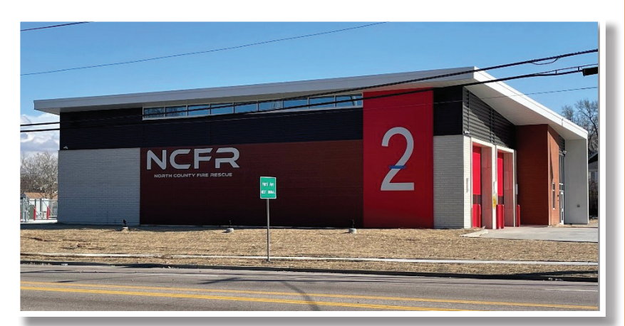
Beautiful newly built North County Fire & Rescue located in Jennings.

NCFR 8790 Jennings Station Road Jennings, MO 63136